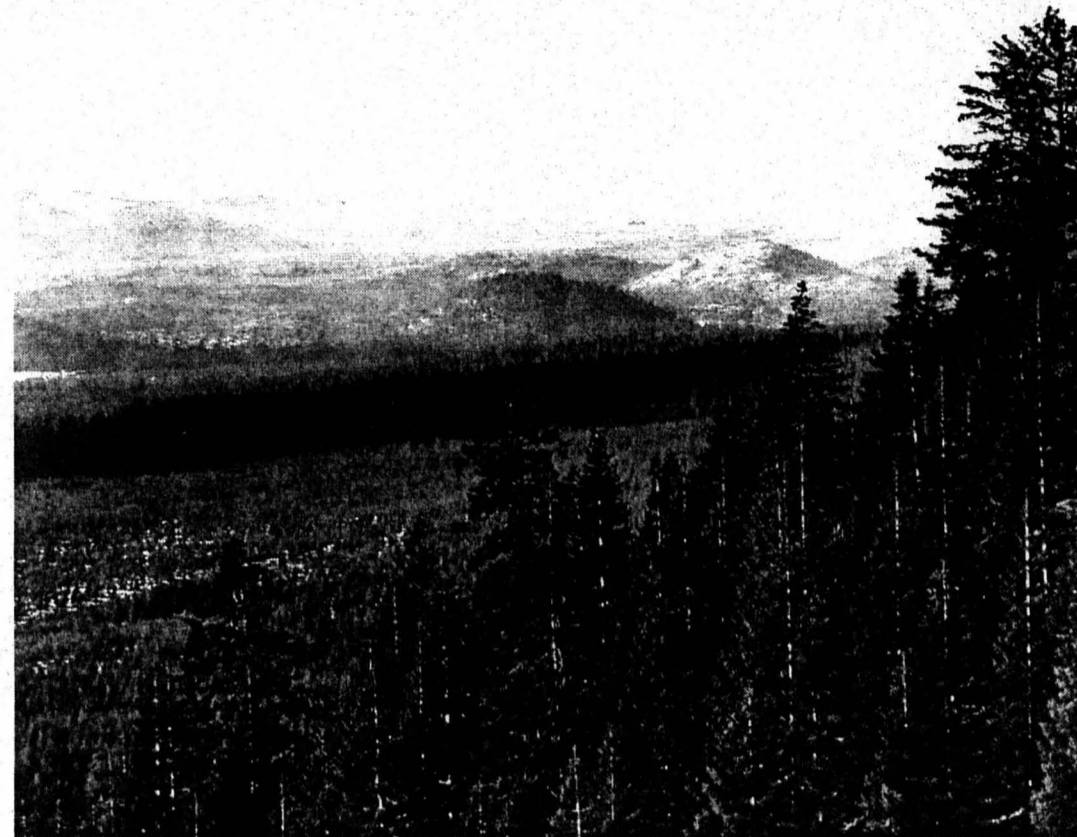
The Pacific Northwest Forest Defense helps save forests like these.

• The decision could also reopen the original Spotted Owl lawsuit under the federal Endangered Species Act, which was the