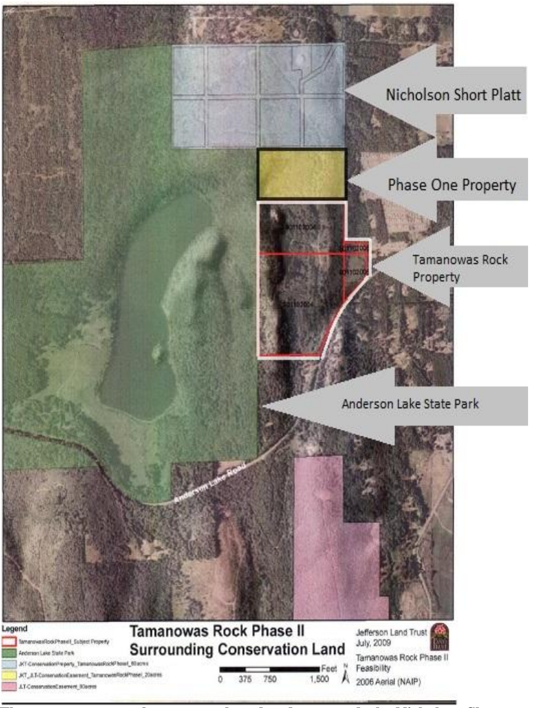
Three separate parcels were purchased and protected: the Nicholson Short Platt, the Phase One Property and the Tamanowas Rock Property

(The map is taken from the Jefferson Land Trust's application for Jefferson County Conservation Futures Funds, 2010)