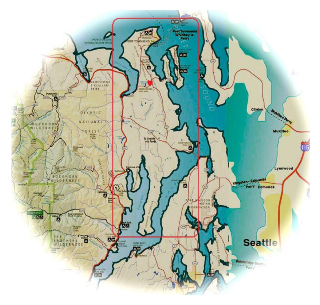
Viewed from above, the Quimper Peninsula resembles a dragon. Tamanowas Rock is the dragon's heart. (No-Qui-Klos: The Dragon of Tomanowas Rock 2011)

Tamanowas Rock is located on a smaller peninsula jutting out from the northeastern corner of the Olympic Peninsula. If you look at a map of the Olympic Peninsula with an imaginative eye you can find the shape of a dragon-like creature on the northeastern corner. Port Townsend is right where the dragon's fire breathing mouth would be, shooting flames toward Whidbey Island. The dragon's long tail is the Toandos Peninsula separating Dabob Bay from Hood Canal. The region that is the dragon's head and neck is called the Quimper