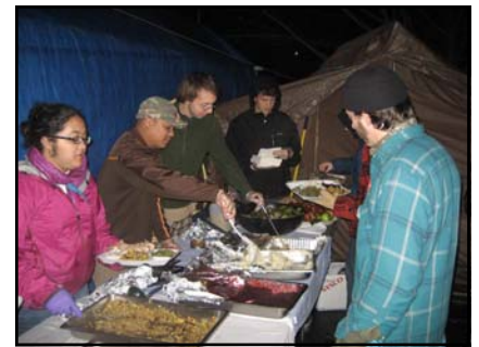
5 meals were organized this year with Evergreen students and Camp Quixote Residents preparing and sharing food together.

SIS has a significant net benefit for the college and the community at large. Students who receive their education awards generally use it to pay school related expenses at Evergreen, so the money is coming right back to the college.