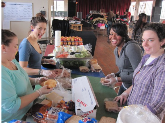
Students prepare lunch at Hip Hop 4 The Homeless

Seminar II E 2125, Olympia Campus; 2700 Evergreen Parkway NW; Olympia, WA 98505; (360) 867-6137; ccbla@evergreen.edu www.evergreen.edu/communitybasedlearning