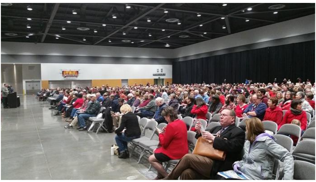
Figure 2. February 10<sup>th</sup>, 2016 public scoping meeting.

Figure 1 illustrates the SEPA review process. The process begins with an applicant for a permit or private proposal. In this case, NWIW was the applicant for approval and there was discussion among different agencies of who should be the lead agency. The three different potential agencies were the City of Tacoma, Port of Tacoma, and Washington Department of Ecology. The state did not want to be the lead agency because of staffing issues. The city decided to be the lead agency because it thought it would be "cleaner." Once a lead agency is chosen, it has to determine if the project is likely to have significant environmental impacts, and the City of Tacoma determined that the methanol refinery would (Tacoma city staff, personal communication, February 17, 2017). If a project is likely to have an environmental impact then an Environmental