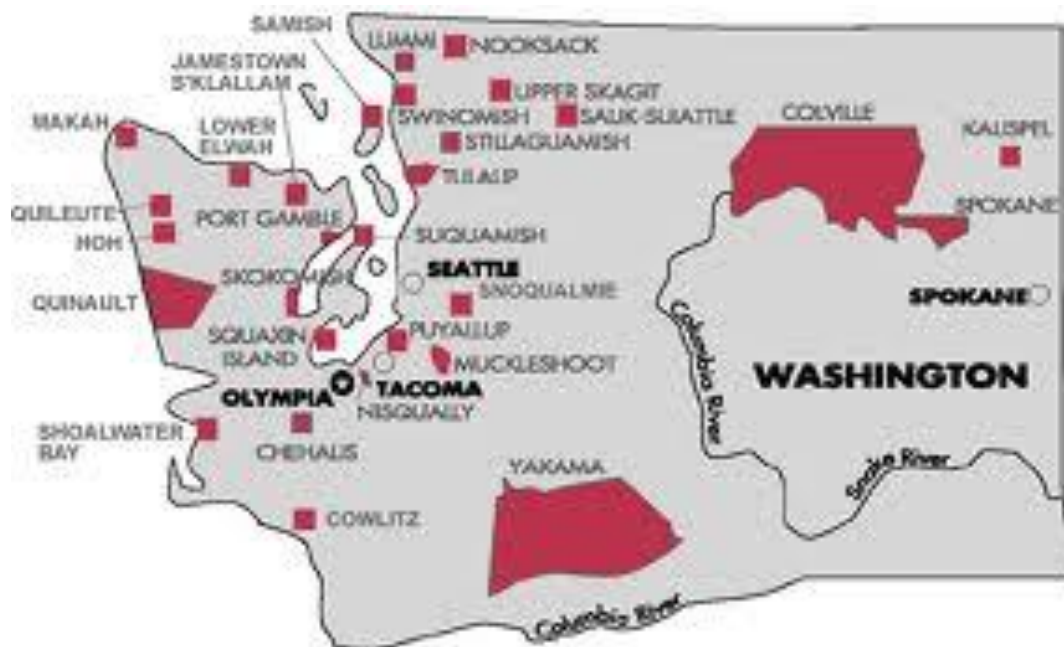
Federally Recognized Tribes in Washington

Demographics. Washington State is among the top states in the U.S. in American Indian/Alaska Native population with 29 federally recognized tribes.