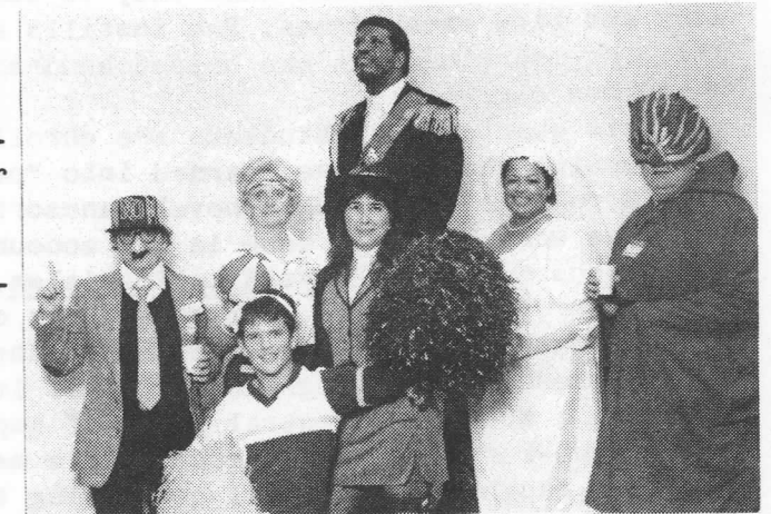
GREENERS ADD GARISH GARNISH TO HALLOWEEN: